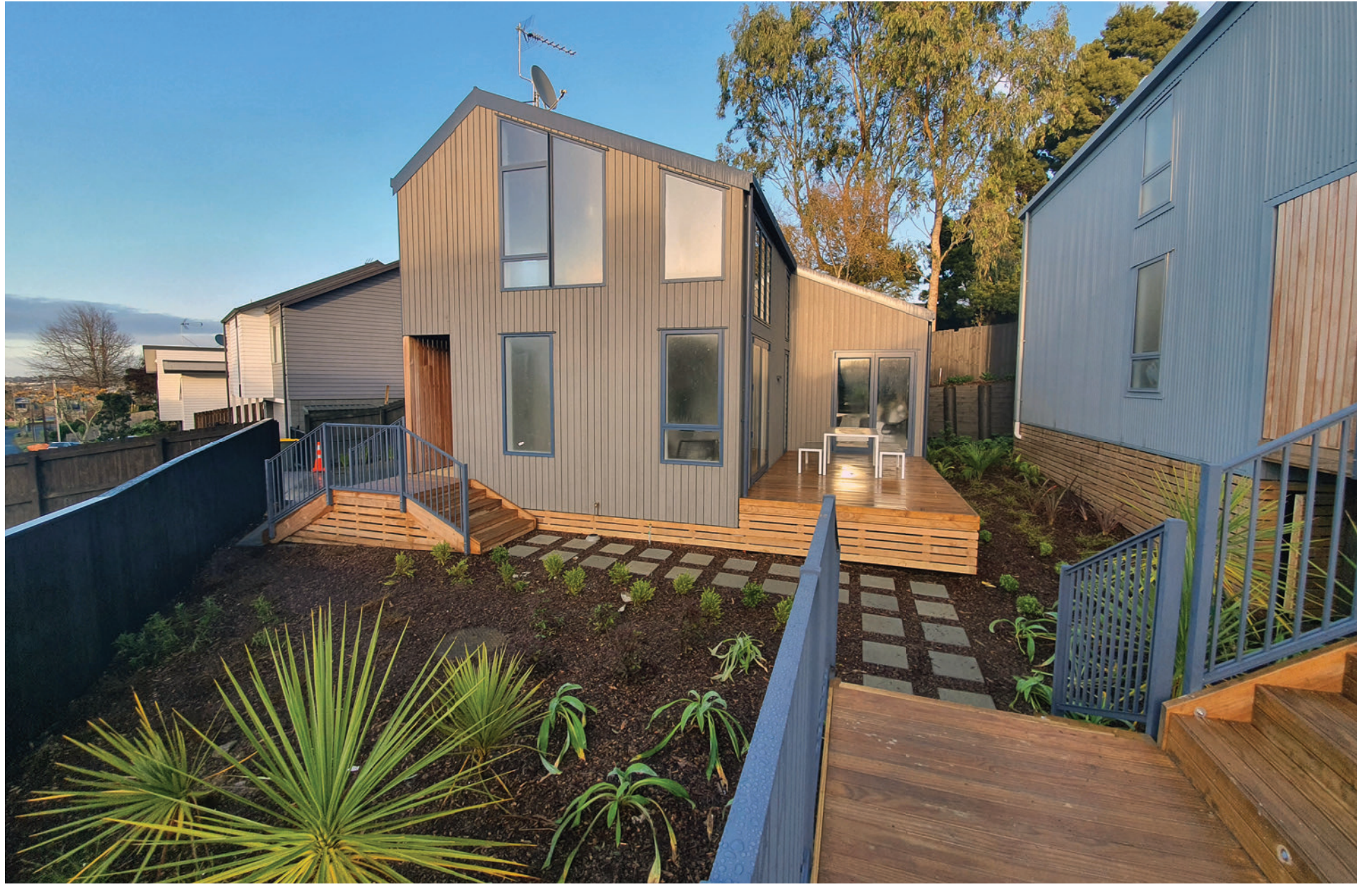
A recently completed Glen Innes development by David Reid Homes Auckland Central & West.